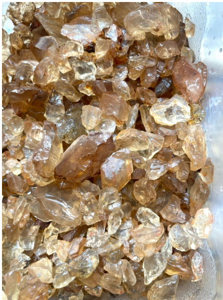
Sunstones we found

At the sunstones, there are tons of fee-dig places that offer conveyor belts of rocks to pick through, but I've never found them to be better than just digging on the free BLM land. There is a good camp area with a toilet and some shaded picnic tables, but no trees. You can collect all around this area. It is perfect for surface picking, although we opted to try to sift the dirt to maybe find unexposed sunstones. You do have to walk away from the parking area as it is very picked over right in the immediate vicinity. We brought sifting boxes, although I found my combination of the green classifier (sifter) that a lot of us have and a regular plastic kitchen colander worked like a charm. The larger classifier caught the big rocks and the kitchen colander let the sand out, so only sunstone sized rocks were left in the colander. Be sure to glance at the larger classifier though, as several times I caught a big sunstone in it!