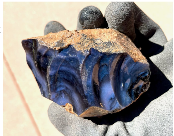
Electric blue obsidian

pile of exceptional pieces including the unbelievable electric blue piece pictured. It's even more stunning in person.