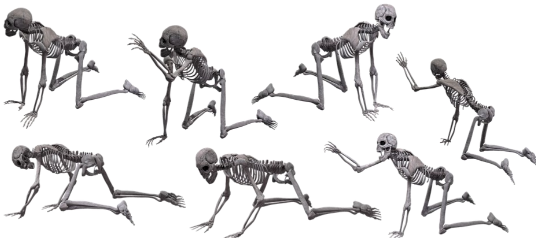
skeleton-3393822_960_720.png (960x415) (pixabay.com)

class schedule & descriptions: www.myfroggiebeads.com