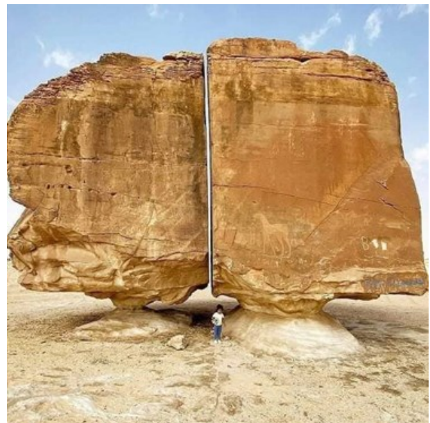
Located in Saudi Arabia, what caused the "slice"? Notice human for scale. .