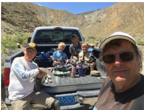
Fossil Hunters at Rest