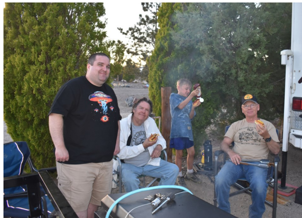
Hot Dog Time