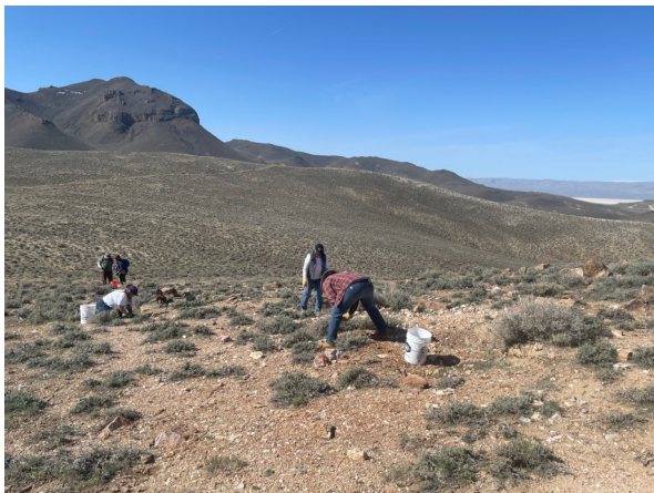
Lovelock agate & jasper

If you do not wish to camp, there are motels in Austin.