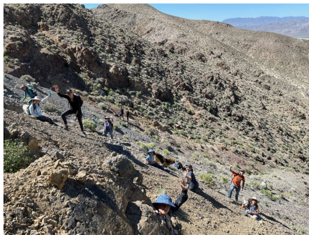
Fossil Hunters