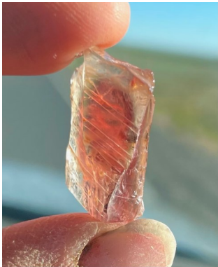
sunstone with schiller