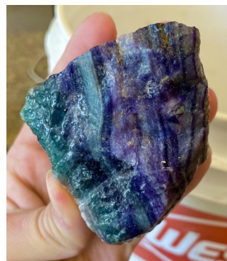
Davis Creek rainbow obsidian