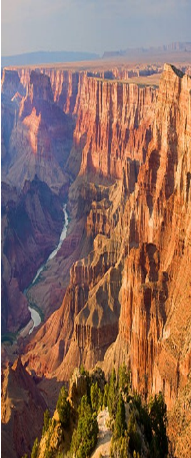
Istock Jose 1983 Unsplash Photo credit of Grand Canyon

The Grand Canyon of Northern Arizona is one of the most spectacular geologic places in the world. It's geomorphic landscape forms a canyon that is 277 miles long and up to 6,100 feet deep. The formation of the Canyon started some 70 million years ago with small rivers, now tributaries to the Colorado River, eroding rocks as the Colorado Plateau was uplifted. Erosion by mostly the Colorado River, is the result of the Canyon's landforms that we see today, and which has taken place over the past 5 to 6 million years, a relatively short geologic time period for eroding such a vast canyon. The Colorado River drops over 14,000 feet to the Gulf of California. The Mississippi falls only 1,000 feet on its way to the Gulf of Mexico. The Colorado River falls ten feet per mile whereas the Mississippi falls only one foot per mile. As the Colorado River moves through the canyon, it drops 2,000 feet in elevation. In comparison, the Mississippi River drops only 1,000 feet on its long journey.