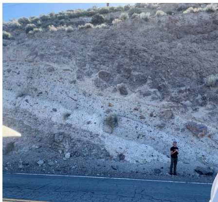
Prof. Putnam showing mudslide over pyroclastic flow