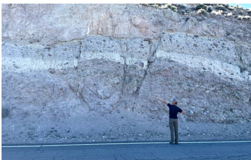
Small natural fault showing displacement