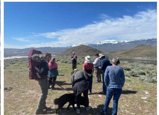
View over Washoe Valley