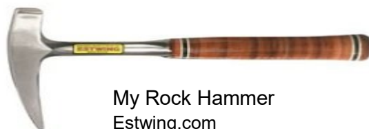
My Rock Hammer Estwing.com

No other business meeting adjourned at 7:51 pm.