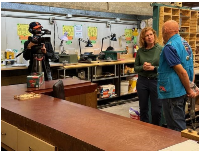
PBS visit

RGMS MEMBERS: BE PROUD AND SUPPORT THE FUTURE GROWTH AND DEVELOPMENT OF OUR ORGANIZATION FOR OUR COMMUNITY AND FOR THOSE ROCKHOUDS TO COME