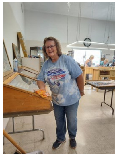
More photos next page