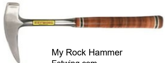
My Rock Hammer Estwing.com